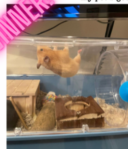
My pet's got talent