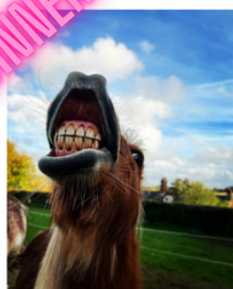
Action shot pet